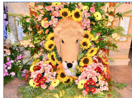
(Top) The Jungle Book , (above) The Lion , the witch and the wardrobe.