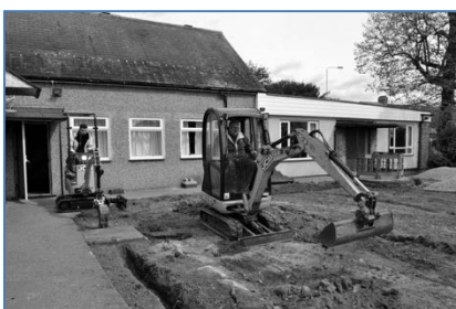
(Above) The preliminary work on the Green – see overleaf.